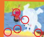
SPOT THE DIFFERENCE